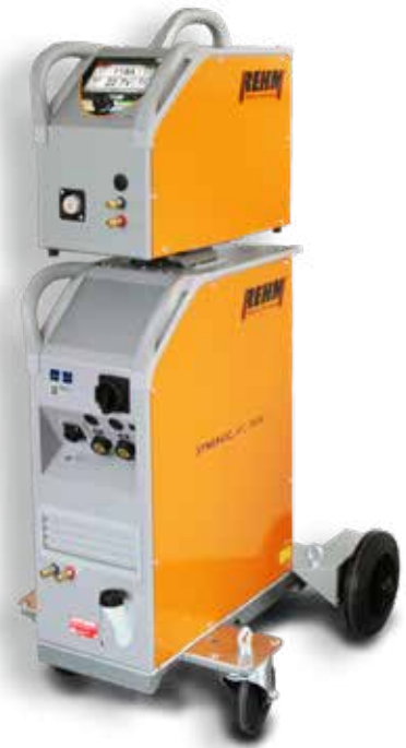
SYNERGIC.ARC 304-504 WS