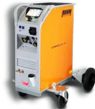
SYNERGIC.ARC 304-504 W